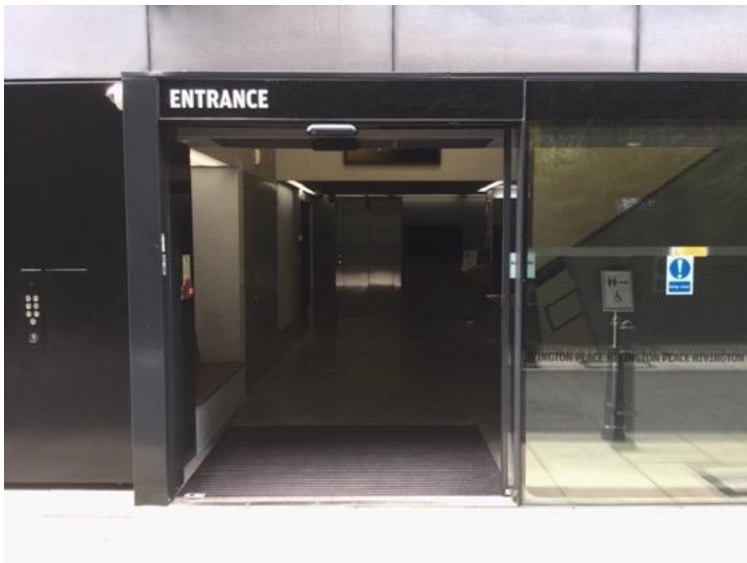
Main entrance - reception desk, inside main entrance